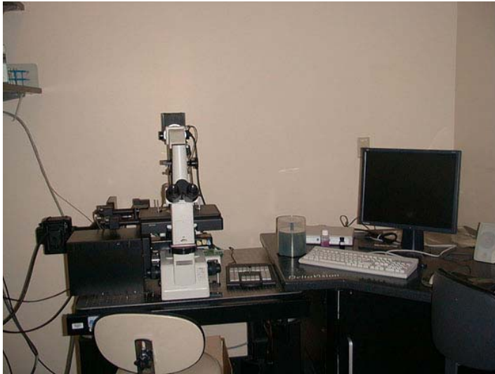
DeltaVision Spectris Restoration Microscopy System